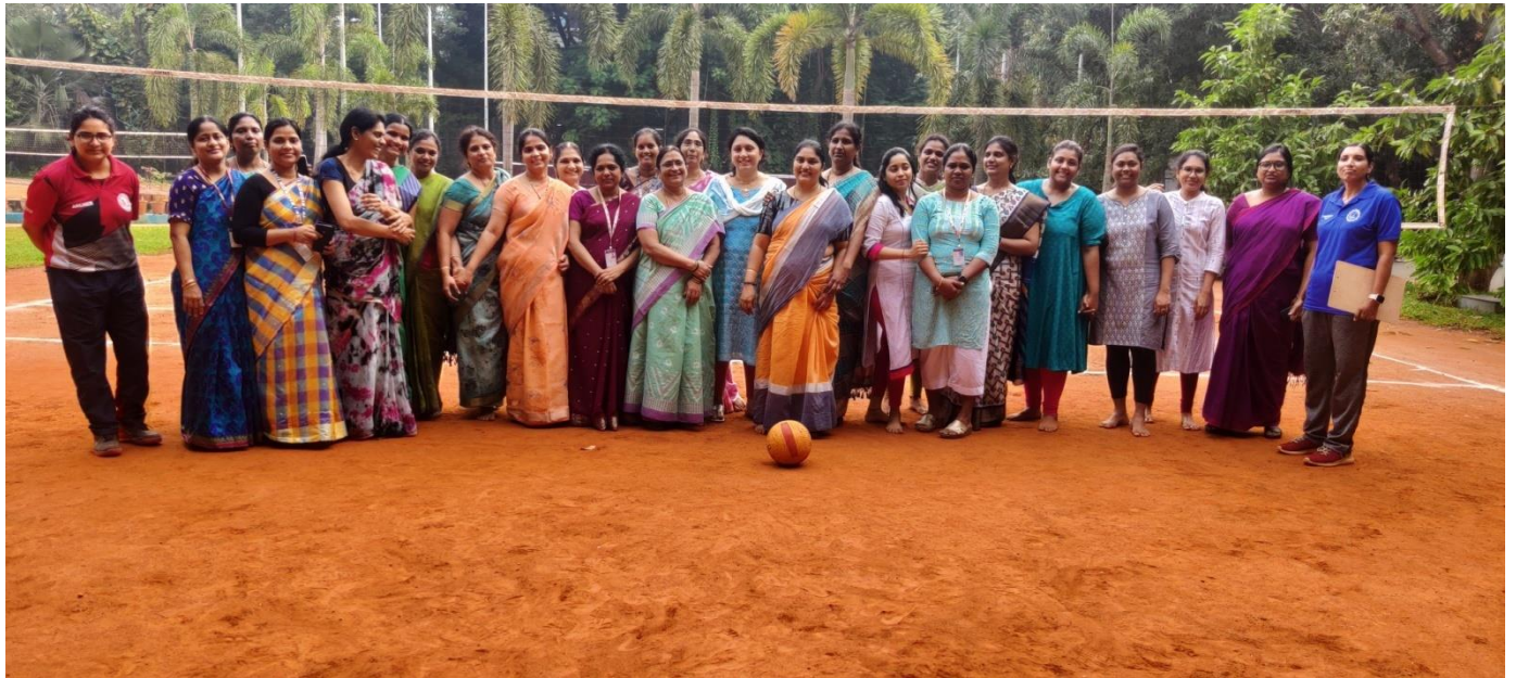
Faculty Women Throwball Team